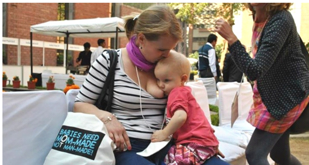
Photo: One of the participants at the World Breastfeeding Conference, India 2012