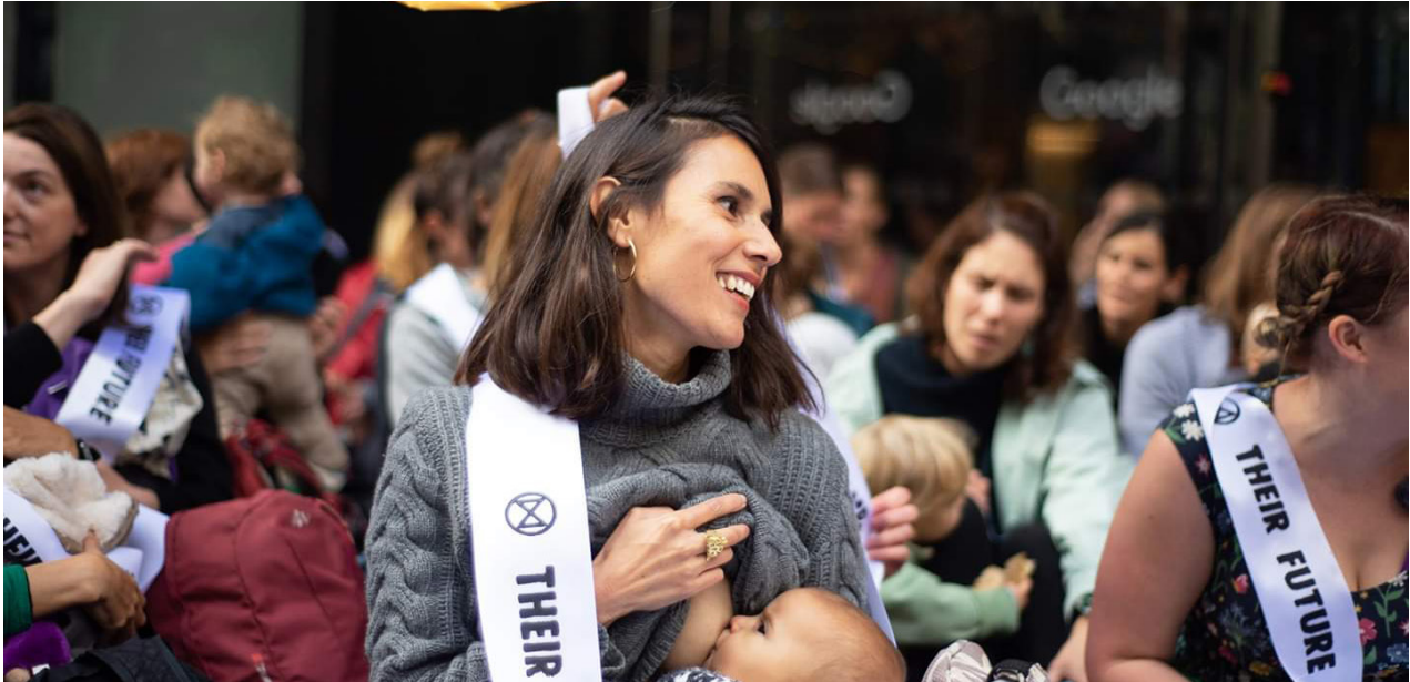
Extinction Rebellion mass 'nurse-in' . Westminster, London October 2019

As world leaders meet in Sharm El-Sheikh, Egypt for the 27th United Nations Climate Change Conference (COP 27), IBFAN is calling for restrictions on the global production and trade of ultra-processed (UPFs) plastic-wrapped and additive-laden products. While many nutrition campaigns have focused on excess sugar, salt and fat, less attention has been paid to the industrial food processing that extends product life for global trade, denatures food ingredients and has had a disastrous impact on human health and the environment. The latest analysis shows that UPF consumption is a significant cause of premature death in Brazil.(1)